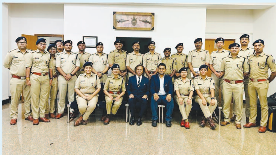
Physical Drill and Arms training for IRS officers at DC level conducted at NEPA, Umiam, Meghalaya from 17.07.2023 to 21.07.2023.