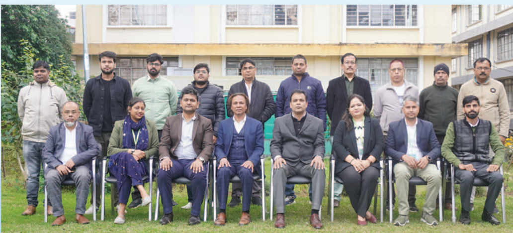
One day training of Customs officials engaged in Food Import Clearance System held on 11.12.2023. FSSAI Officials from New Delhi and Guwahati delivered lectures.