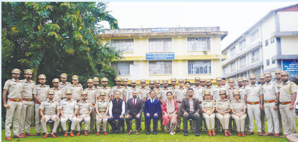
Induction Training for Inspectors of CBIC - 2019 & 20 Batch (9th Batch) from 24.04.2023 to 12.07.2023