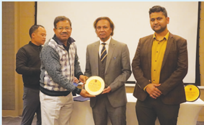
Three days "Train the Trainers Workshop to combat illegal trade in HCFCs" was conducted from 20.11.2023 to 22.11.2023