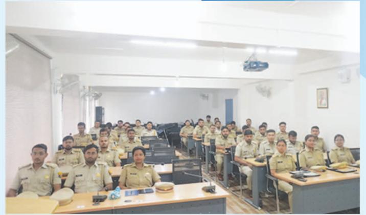
Workshop on Cyber Forensic, Artificial Intelligence Data Analytics was held on 22.06.2023 through Hybrid Mode.